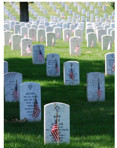
Headstones at Arlington National Cemetery graced by US Flags on Memorial Day Weekend